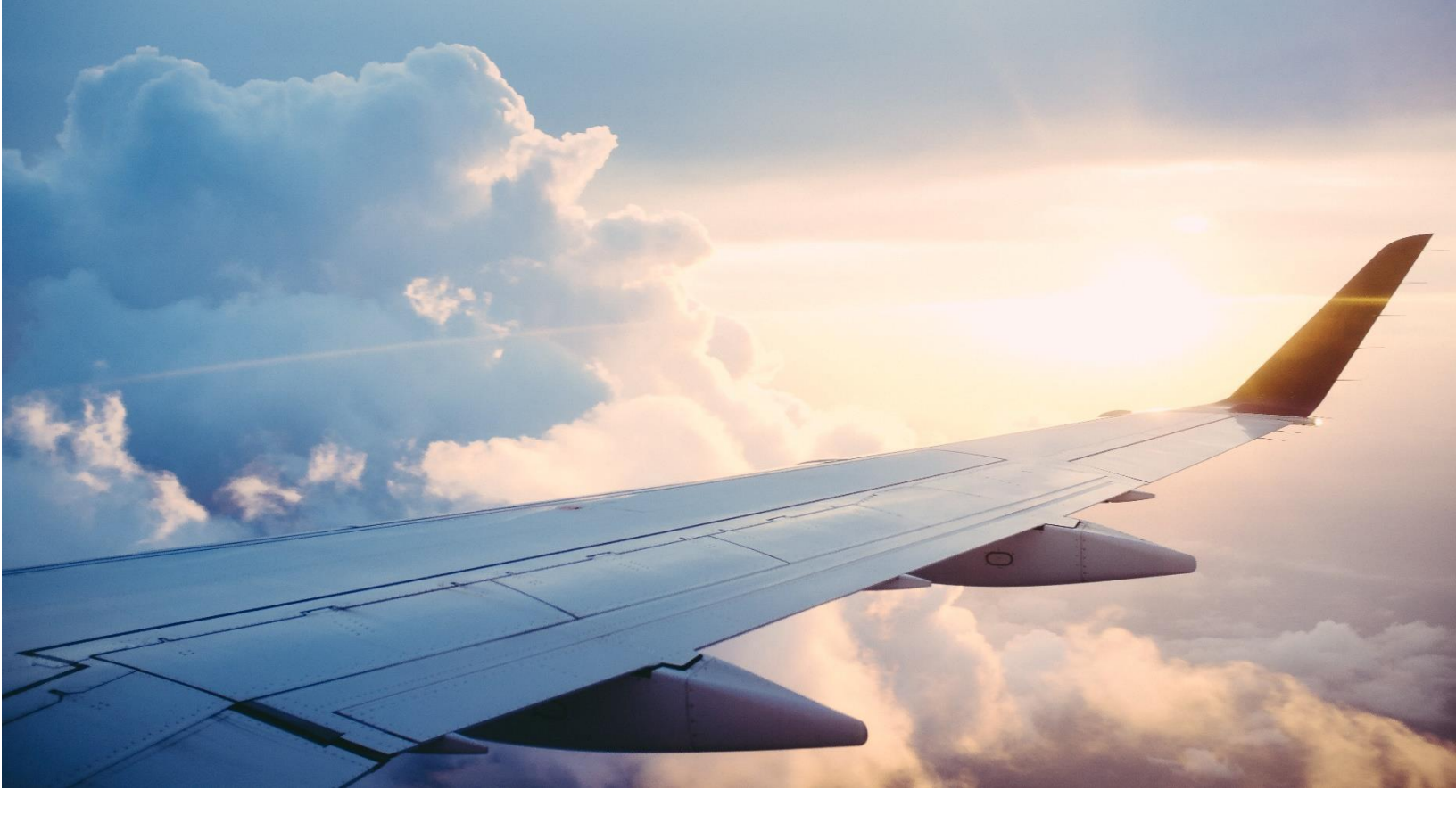
The New Customs Study